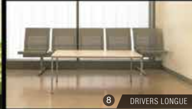
8 DRIVERS LONGUE