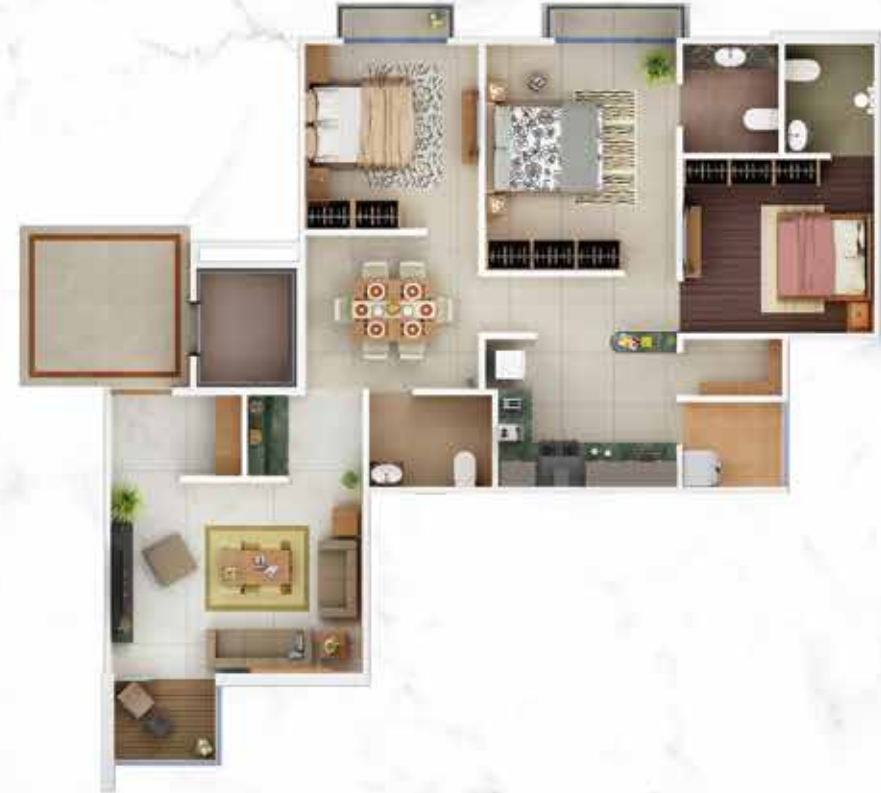
UNIT PLAN = 1663 SQ.FT UNIT NOS. 102, 202, 302, 402, 502, 602, 702, 802, 902, 1002