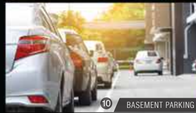
10 BASEMENT PARKING