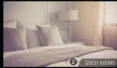
2 GUEST ROOMS