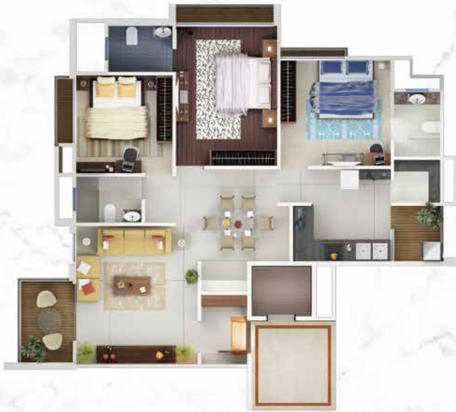
UNIT PLAN = 1892 SQ.FT UNIT NOS. 101, 201, 301, 401, 501, 601, 701, 801, 901, 1001, 1101, 1201.