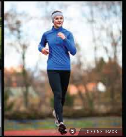
5 JOGGING TRACK