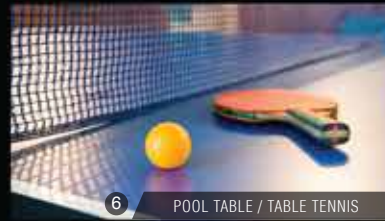
6 POOL TABLE / TABLE TENNIS