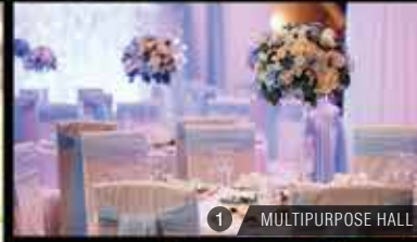
1 MULTIPURPOSE HALL