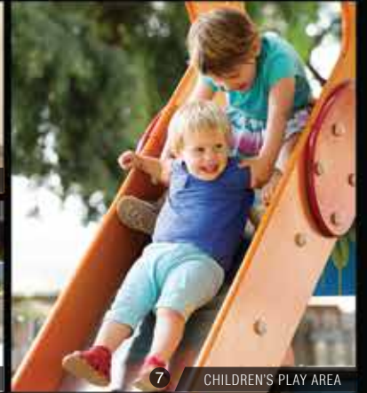
7 CHILDREN'S PLAY AREA