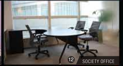
12 SOCIETY OFFICE