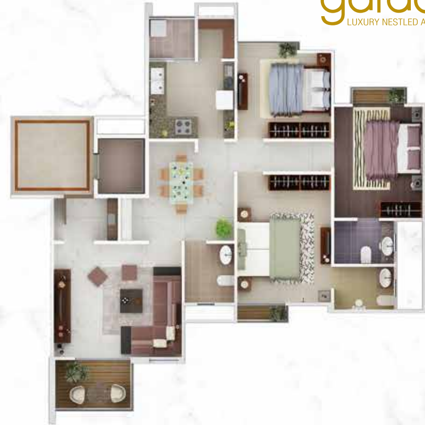
UNIT PLAN = 1892 SQ.FT | 3BHK ( BLOCK - A & D ) UNIT NOS. 102, 202, 302, 402, 502, 602, 702, 802, 902, 1002, 1102, 1202.