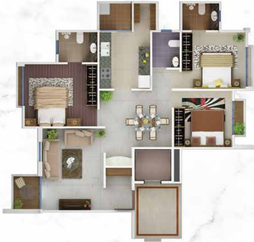
UNIT PLAN = 1663 SQ.FT UNIT NOS. 101, 201, 301, 401, 501, 601, 701, 801, 901, 1001