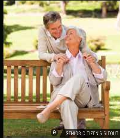
9 SENIOR CITIZEN'S SITOUT