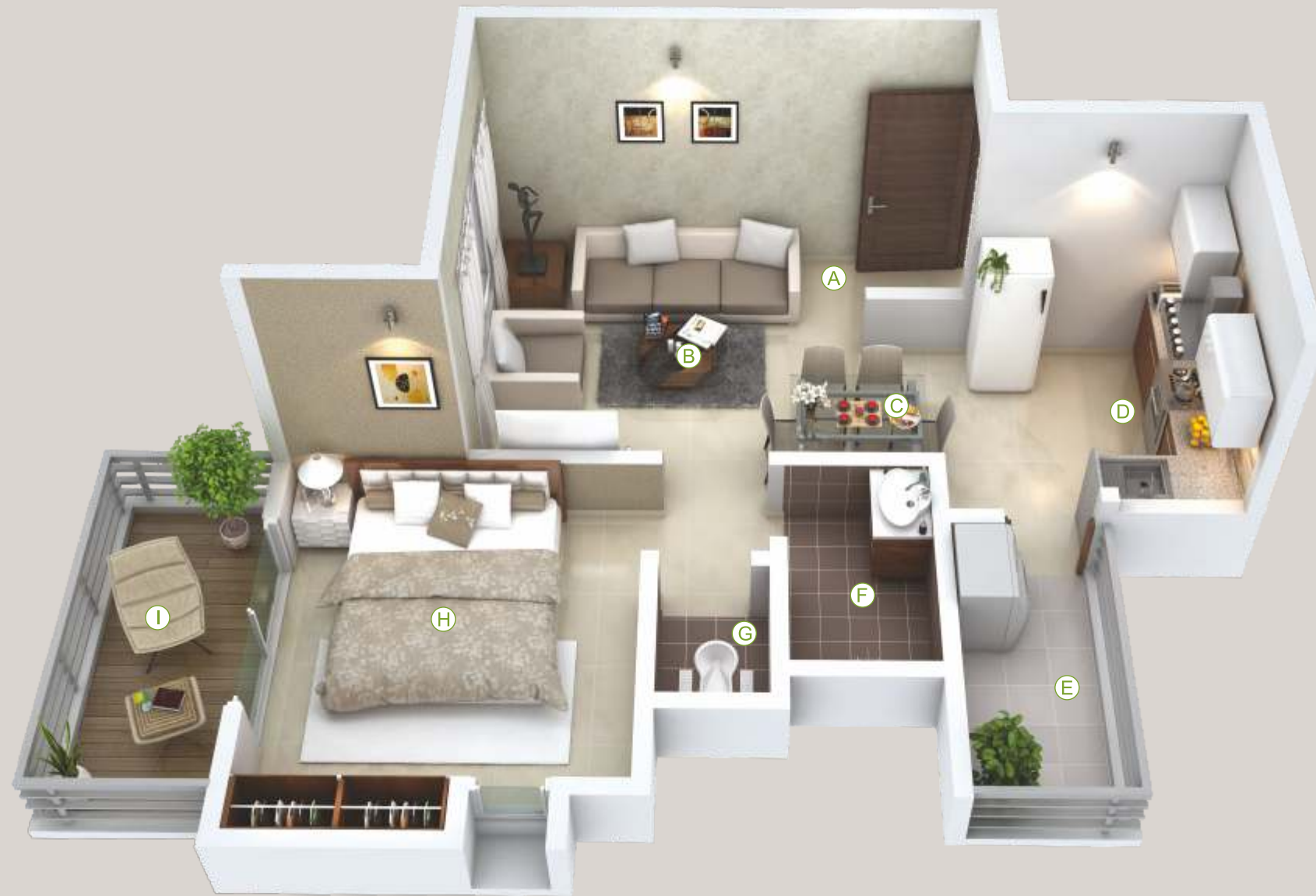
1 BHK APARTMENT